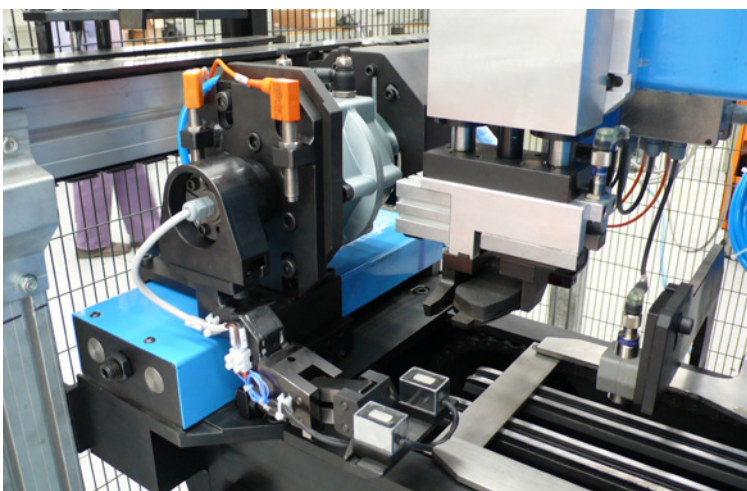
Loading manipulator having 550 pcs/h

Function of this machine is the automatic grinding of brake pads, friction material side.