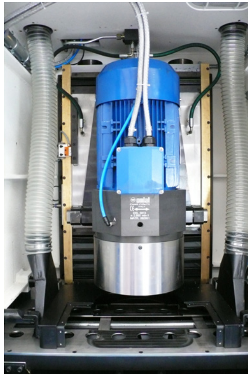
Machine inside – Grinding head